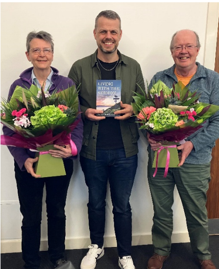
Photo taken at URC North West Synod Meeting at Lancaster University Saturday 5th October 2024